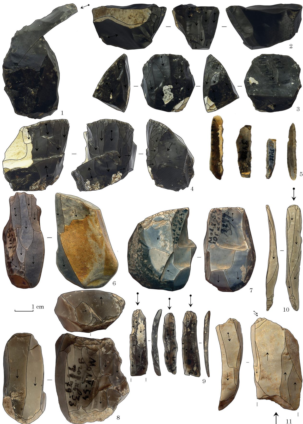
Fig. 2. Mitoc-Malu Galben, «Aurignacian III», F03—G03 sample (1, 2), «Aurignacian III Supérieur » (3, 4), Moldova V, cultural horizon 10 (5—7) and Moldova V, cultural horizon 9 (8—11): 1 — Refit of «carinated burin» and «burin spall»; 2—4, 6—8 — Bladelet cores; 5 — Backed bladelets; 9 — Bladelets examples; 10 — Burin spall; 11 — Dihedral / Multiple burin-core (Photos and CAD 1—11 — Timothée Libois)